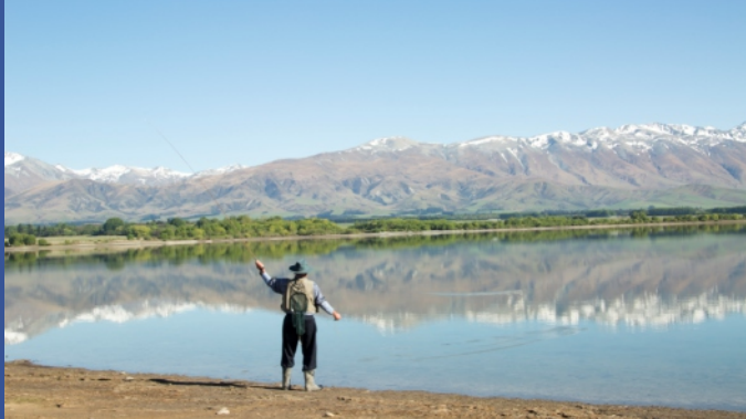
Fishing, Lake Opuha