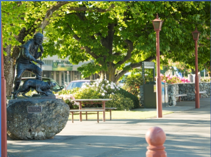
James Mackenzie Statue, Village Centre

The statue of James Mackenzie and Collie dog resides in the centre of the Fairlie township. Read about the legend that gave the Mackenzie District its name.