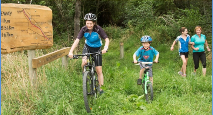
Fairlie-Kimbell Walk & Cycle Track