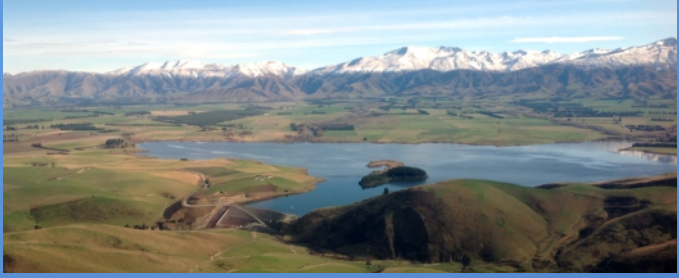
Aerial Photo: Lake Opuha